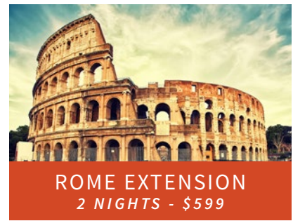
ROME EXTENSION 2 NIGHTS - $599

LEGEND: ( ) = Included meal, B = Breakfast, D = Dinner, DB = Dinner Banquet