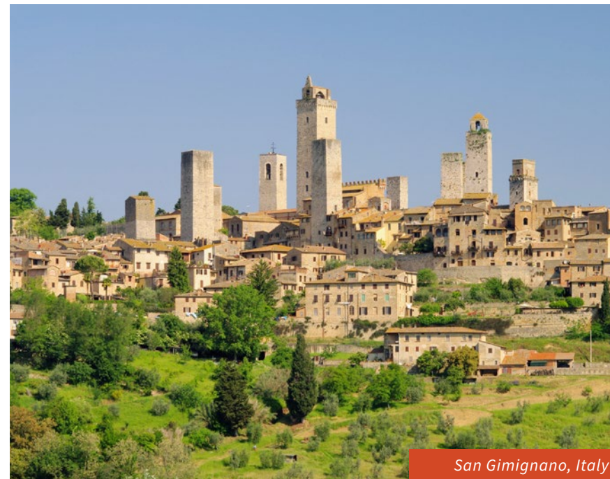
San Gimignano, Italy

After breakfast we travel into the heart of Tuscany. As we travel south you will recognize many of the landscapes from the movie “Under the Tuscan Sun,” filmed in this area. Visiting the walled city of San Gimignano, you will admire the many towers, once the skyscrapers of the 13th and 14th centuries, the best-preserved medieval village in Italy. We will stroll around the tiny streets leading to the top of the village, maybe stop in one of the many cafes and small trattorias for a sandwich and a “gelato”... Italian ice cream. [Chamber Experience] As you drive south through the Italian wine country of Chianti this afternoon, your stop will include a winery to taste